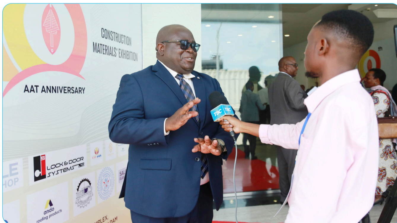
Deputy Minister for Works, Eng. Godfrey Kasekenya, speaks at the East Africa Building and Construction Awards 2023 ceremony in Dar es Salaam on December 7, 2023

Framework contracts are now signed in the NeST and the procurement process is done in the system. Register today through nest.go.tz