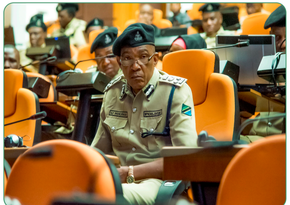
Police staff officers follow NeST training organized by PPRA, recently in Dar es Salaam