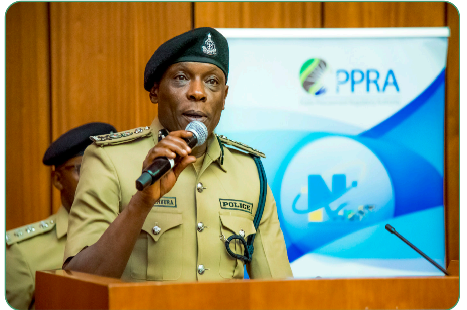
Inspector General of Police, Camillus Wambura, addresses participants during opening of training on NeST for senior officers of the police force on December 13, 2023, in Dar es Salaam